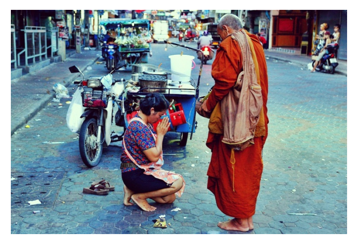
Paying respect to a monk in Thailand

Those who followed the Buddha came to be called the Sangha—the community of monks (bhikshus) and nuns (bhikshunis). Those who became monks and nuns underwent an ordination ceremony of shaving their heads and donning robes to symbolize world-renunciation. They entered into the homeless life of wandering monastics who settled down in monasteries only during the months of the rainy season.