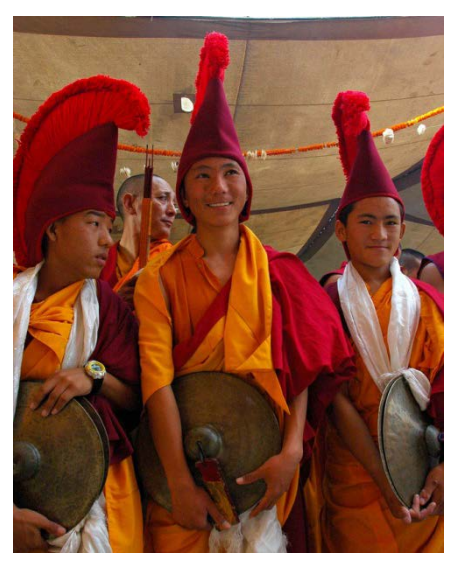
Musicians at Tharlam Monastery, Kathmandu, Nepal (2007)

Three terms characterize the practice of Vajrayana, each one of which has overt ritual meanings, inner psychophysical meanings, and secret transcendent meanings: