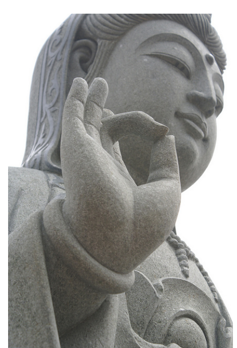
A mudra displayed on a statue of the Buddha at the Chuang Yen Monastery in New York (2011).

Mantra—a syllable or phrase for chanting or meditation, containing within it the sacred power and cosmic energies of a Buddha or bodhisattva. The mantra literally "protects the mind" from negative mental states by invoking these divine energies within oneself.