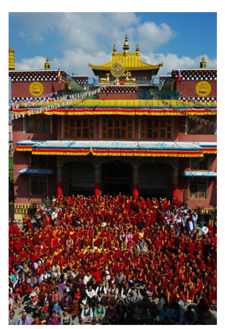
Monks gather at Tharlam Monastery, Kathmandu (2007)

The Buddha, the Dharma, and the Sangha continue to provide inspiration to Buddhists, but they are not understood in exactly the same way everywhere. A Sri Lankan Theravada Buddhist might insist that the Buddha was a human pathfinder, nothing more. A Chinese Pure Land Buddhist might chant the name of Amitabha Buddha, seen as the eternal Buddha of Endless Light, with a prayer