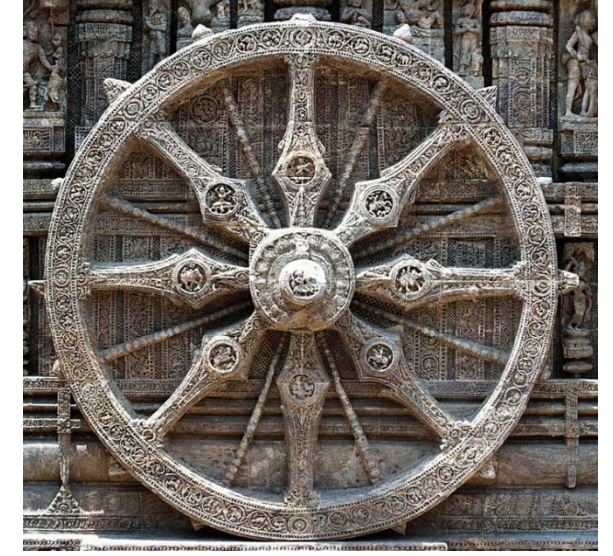
Right livelihood. Earning a living in ways that are consonant with the basic precepts.